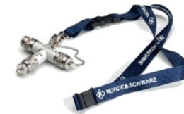
Combined OSL calibration kit (R&S®FSH-Z29)