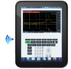
Tablet with Android / iOS app to remote control the analyzer